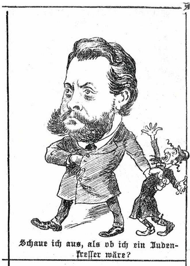
9. 'Do I look like I would eat Jews?', Glühlichter , December 1892. Karl Lueger (1844–1910), Austrian Christian Social leader and mayor of Vienna, was notorious for his cynical opportunism and hypocrisy regarding antisemitism; he was one of Hitler's role models, together with Georg von Schönerer, in Mein Kampf .