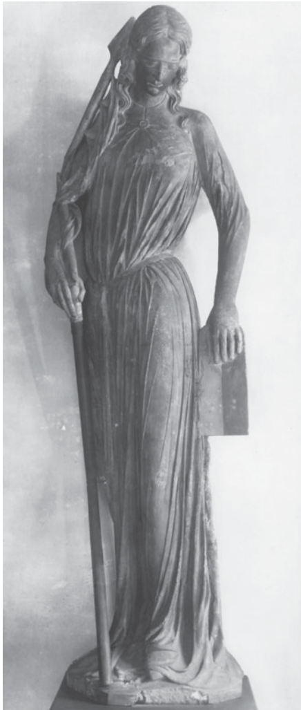
1. 'Synagogue', Strasbourg Cathedral (c. 1230). A common part of medieval Christian iconography, the depiction of Judaism as a blind woman was intended to symbolize the benighted nature of the Jewish refusal to recognize the truth of Christianity.