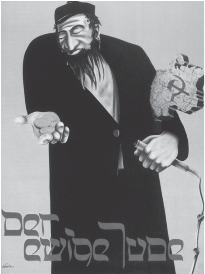
11. 'The Eternal Jew', Nazi poster (1937). Jewish world conspiracy: 'The Jew' has money in one hand, a whip (power) in the other, and the Soviet Union in his pocket.