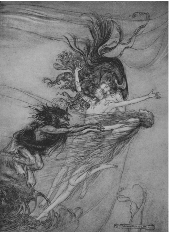
6. Arthur Rackham, 'The Rhinemaidens Teasing Alberich' (1911). The character Alberich in Richard Wagner's The Ring of the Nibelungen has been seen as a cipher of the composer's antisemitic ideology.