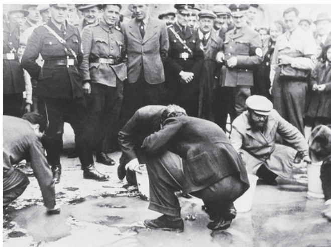
12. Jews scrubbing the street in Vienna, March 1938

Nazi policy towards the Jewish Problem had a very pragmatic side. Given their antisemitic contention that Jews were not German and therefore should not be part of German society, but recognizing the limits on their actions set by domestic and international standards, the initial Nazi policy was to encourage Jews to leave Germany, and to facilitate this both by rank intimidation and persecution at home, and improving emigrants' prospects abroad. Hence the Nazi regime made a 'devil's pact' with Zionists in the Ha'avara Agreement which allowed German Jews