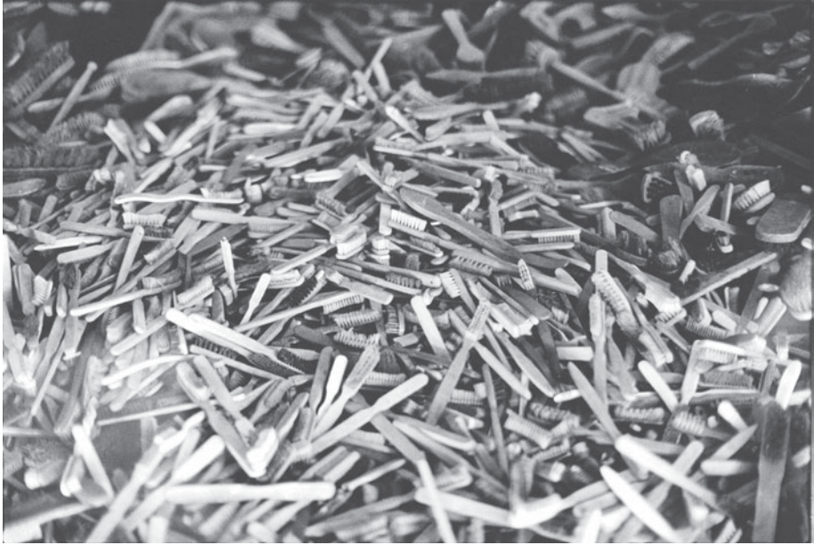
13. Auschwitz: toothbrushes