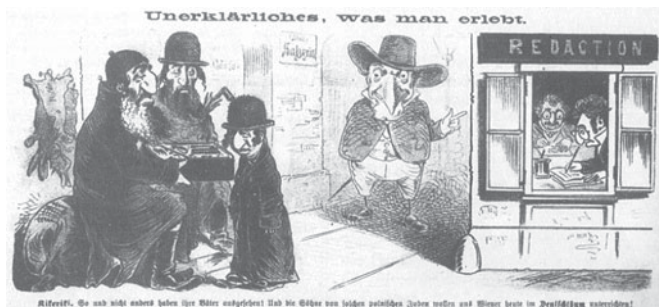
7. 'Inexplicable what one experiences', Kikeriki , 9 September 1883. Kikeriki cartoon: 'Thus and not other wise did their fathers appear! And today the sons of such Polish Jews want to teach us Viennese about Germanness!'