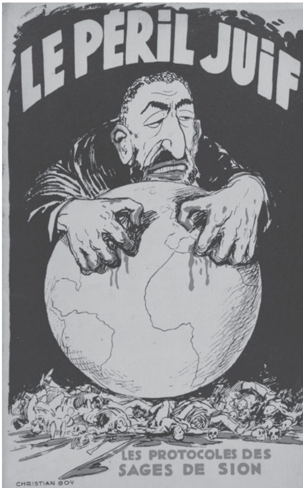
14. The Jewish Danger: The Protocols of the Elders of Zion , French edition (c. 1940). First published in Russian in 1903, the forged account of an alleged Jewish world conspiracy has appeared in many languages, including Arabic, and recently appeared as a dramatic serialization on Arabian television.